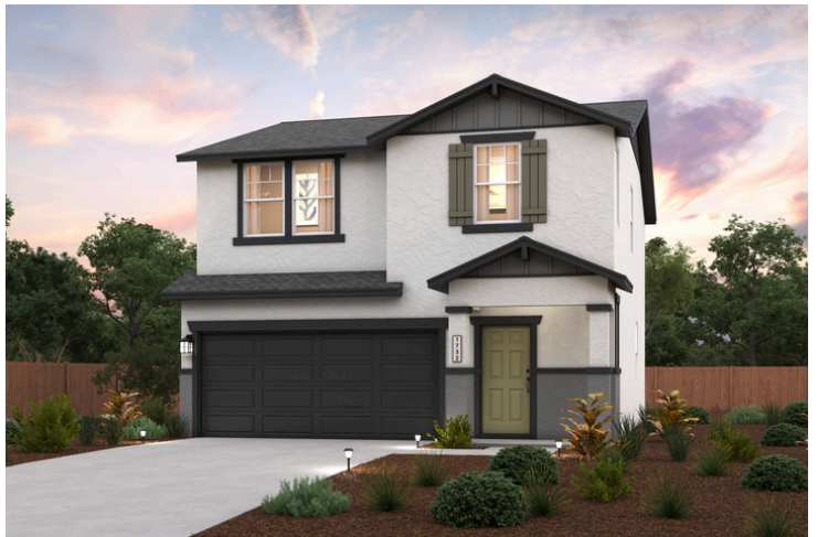
Elevation B - Bungalow