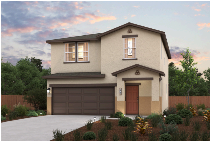
Elevation A - Early California

APPROX. 1,732 SQ. FT. | 2-STORY | 4 BEDS | 2.5 BATHS | 2-BAY GARAGE