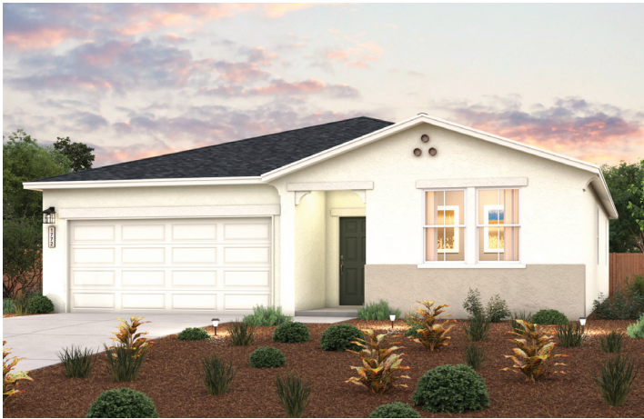
ELEVATION A - EARLY CALIFORNIA

APPROX. 1,772 SQ. FT. | 1-STORY | 4 BEDROOMS | 2 BATHROOMS | 2-BAY GARAGE