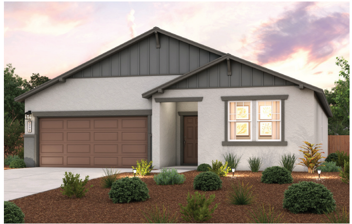
ELEVATION B - BUNGALOW