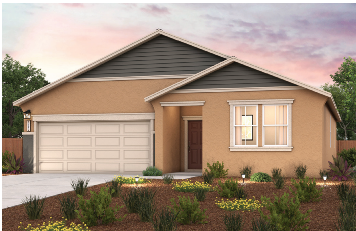
ELEVATION C - COTTAGE